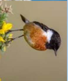
From left to right: Red-breasted Merganser, Cough, Puffin, Stonechat