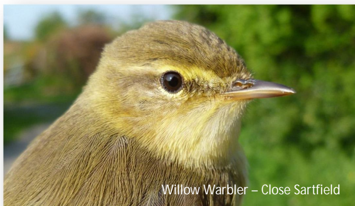
Willow Warbler – Close Sartfield